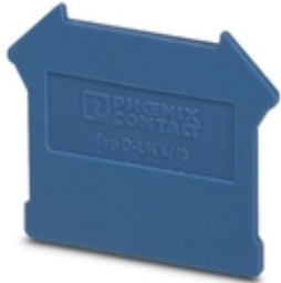
End cover, length: 42.5 mm, width: 1.8 mm, height: 47 mm, color: blue

Please be informed that the data shown in this PDF Document is generated from our Online Catalog. Please find the complete data in the user's documentation. Our General Terms of Use for Downloads are valid ( http://phoenixcontact.com/download )